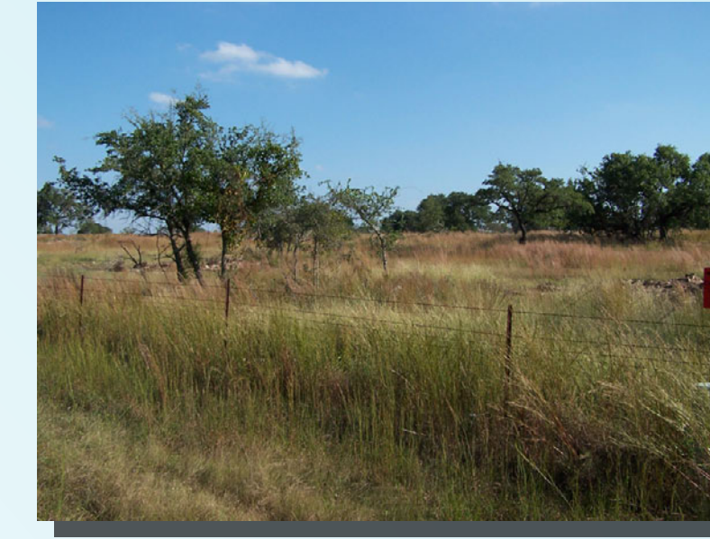
The LCRA Creekside Conservation Program assists Blanco County landowners with the cost of cross fencing for improved grazing management.