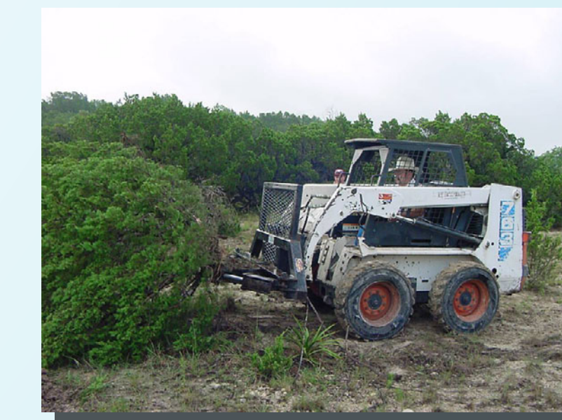
Hydraulic tree shearing has become a popular method for selective brush removal.

Creekside Conservation Program Properties